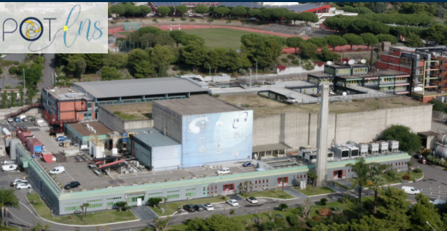
INFN, LNS Laboratori Nazionali del Sud