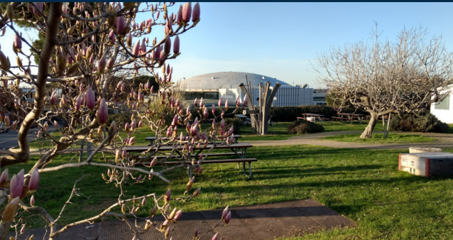
INFN, LNF Laboratori Nazionali di Frascati